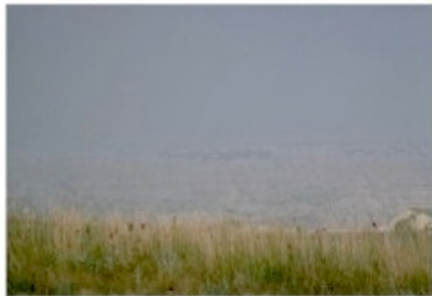
...a hazy day