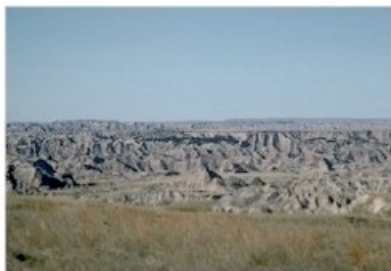
...a clear day

Submitted by Kurt Repanshek (/users/repanshek) on January 19, 2011 - 10:55am