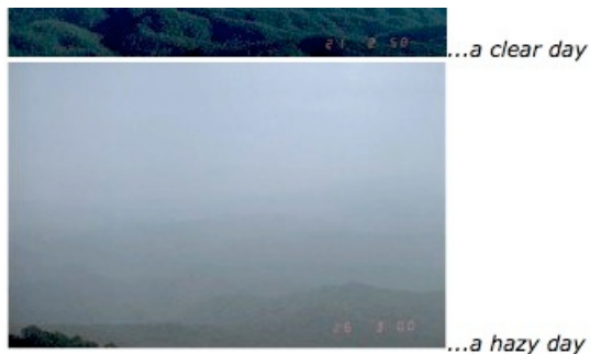
Photos taken by the Environmental Protection Agency compare clear days with hazy days at, top to bottom, Badlands National Park, Crater Lake National Park, and Great Smoky Mountains National Park.

required by the Clean Air Act. Leaving our mountains and canyons buried under filthy haze is not an option.”