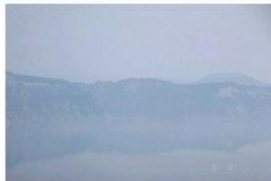
...a hazy day